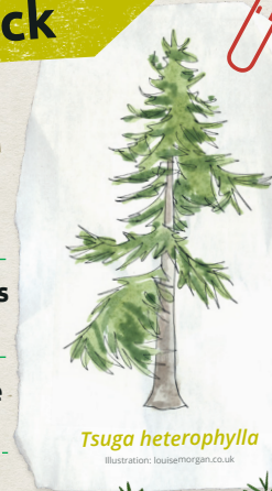
Tsuga heterophylla Illustration: louisemorgan.co.uk