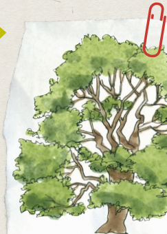
Fraxinus excelsior Illustration: lousemorgan.co.uk