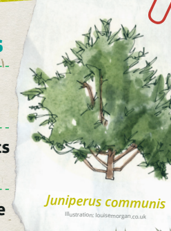
Juniperus communis Illustration: louisemorgan.co.uk