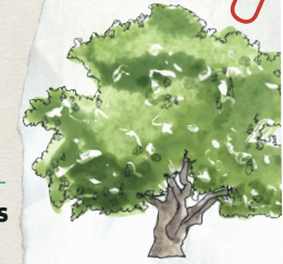
Quercus robur Illustration: lousemorgan.co.uk