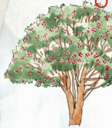
Sorbus aucuparia Illustration: louisemorgan.co.uk