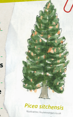
Picea sitchensis Illustration: louisemorgan.co.uk