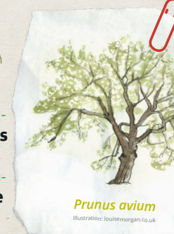
Prunus avium Illustration: louisemorgan.co.uk