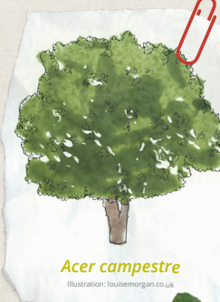
Acer campestre Illustration: louisemorgan.co.uk