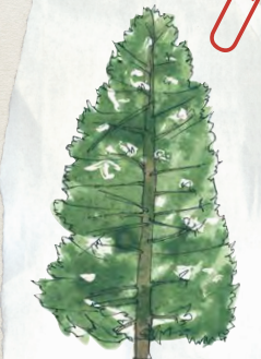
Picea abies Illustration: louisemorgan.co.uk