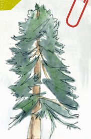
Abies procera Illustration: louisemorgan.co.uk