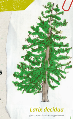
Larix decidua Illustration: louisemorgan.co.uk