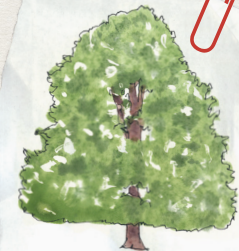
Tilia cordata Illustration: louisemorgan.co.uk