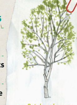
Betula pubescens Illustration: louisemorgan.co.uk