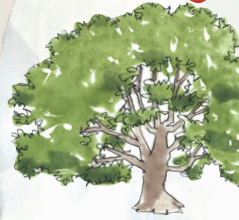
Acer pseudoplatanus Illustration: louisemorgan.co.uk