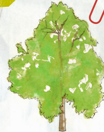
Populus tremula Illustration: louisemorgan.co.uk