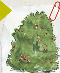
Ilex aquifolium Illustration: lousemorgan.co.uk