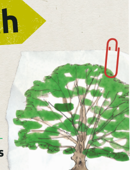
Fagus sylvatica Illustration: lousemorgan.co.uk