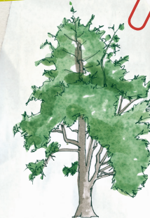
Pseudotsuga menziesii Illustration: louisemorgan.co.uk