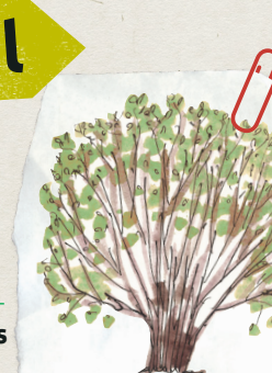
Corylus avellana Illustration: lousemorgan.co.uk