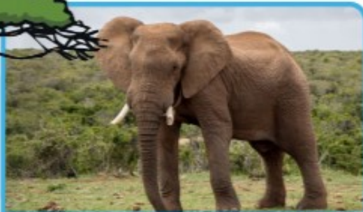
an African elephant

There are three simple ways to tell whether the elephant you are looking at is an African elephant or an Asian elephant. You can look at their ears, the shape of their head and their tusks.