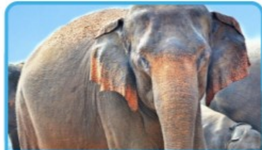
an Asian elephant