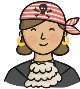
Pirate Jenny's Treasure

Challenge: What fraction of the treasure does Pirate Jenny get?