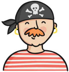
Pirate Jack's Treasure