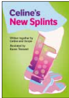
Celine's New Splints